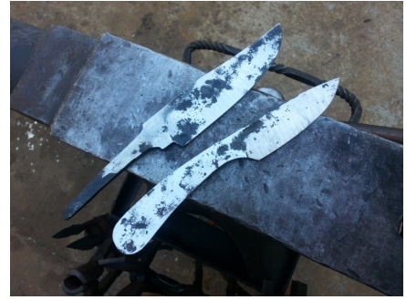
Here are pics of the knives during the forging demo and then he finished them the week after the Show.